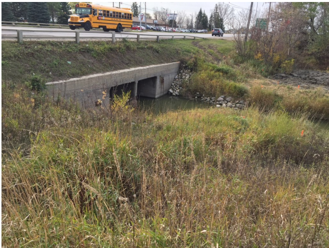
Existing concrete culvert over Grassmere Drain

The culvert over 100 years old, has reached the end of its service life and needs to be replaced. Manitoba Infrastructure (MI) has determined that the most cost-effective solution is to replace the existing culvert with a new bridge. The project will include improvements to PTH 9 in the immediate vicinity of the new bridge that will be consistent with future upgrades of the highway.