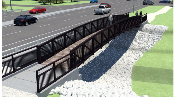
Grassmere Creek Pedestrian Bridge on PTH 9, view looking north-west

In addition to the vehicular bridge, a pedestrian bridge will also be constructed east of the new structure.