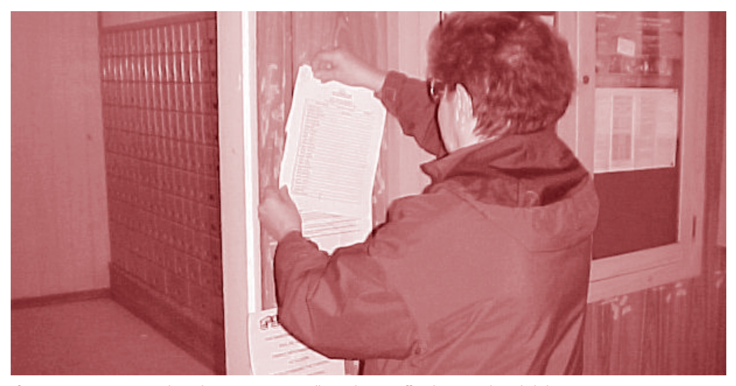
If your name is not on a voter list, ask a community councillor or elections officer how it can be included.