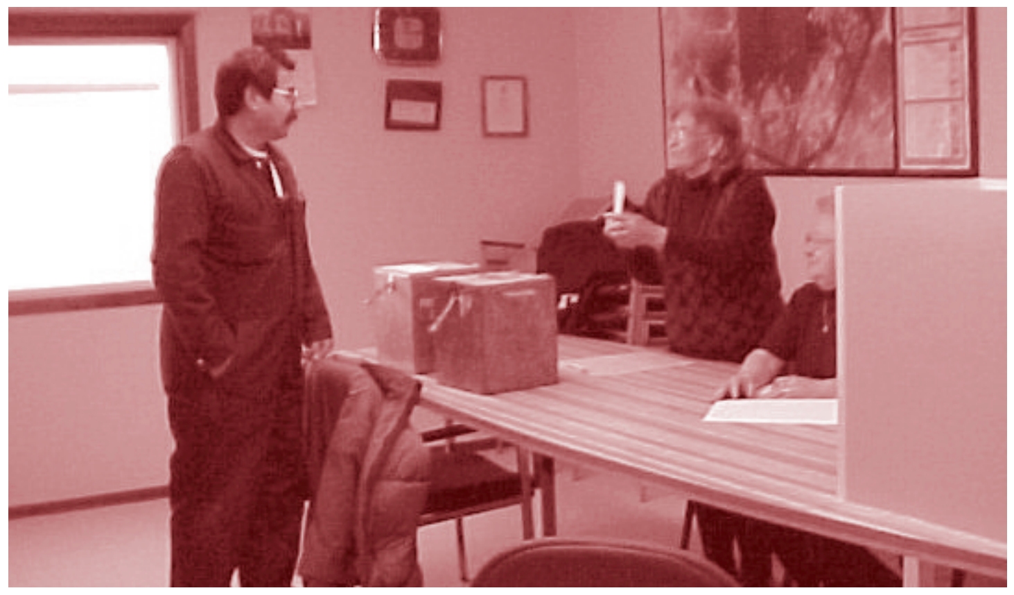
After voting, electors hand their folded secret ballot to an election officer who places it in a sealed ballot box.

candidate may begin a campaign to promote his or her candidacy. Any campaign activities, such as putting up posters, handing out brochures and participating in town hall debates, must follow regulations and guidelines.