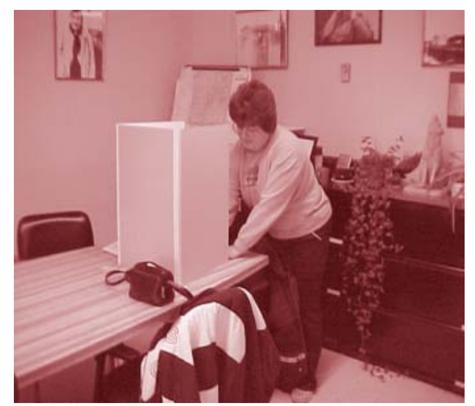
Registered voters use a secret ballot provided for marking their choices.

People who cannot be candidates for council include constables, clerks or other paid employees or officials of the council, and members of other community, municipality or band councils. The Northern Affairs Act contains a complete list.