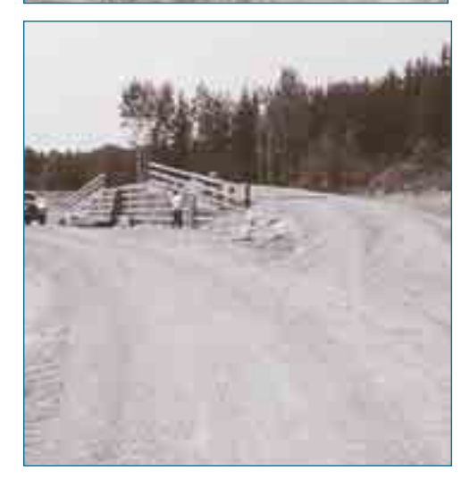
Communities use local taxation revenue to help support the costs associated with infrastructure such as construction and maintenance of community-owned roads, water and sewage facilities, landfill operations and buildings.