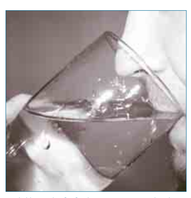
A reliable supply of safe, clean water is essential to the well-being of every community.

n recent years, there has been a lot of attention focused on public water systems in Manitoba and all across Canada. In the wake of tragic incidents involving poorly managed public water treatment facilities in other parts of Canada, the Manitoba government began drafting legislation to ensure all Manitobans have clean, safe water for drinking and household use.