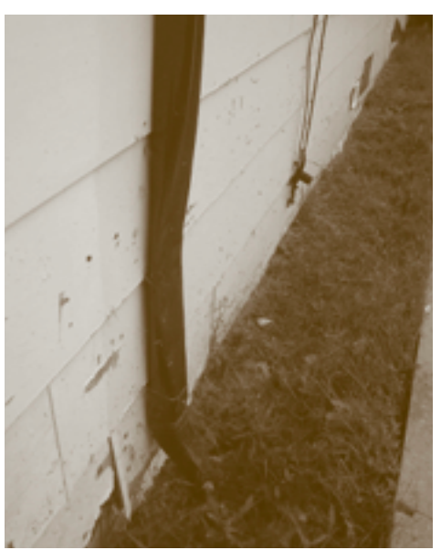
Clockwise from top, a missing splash pad, a crushed drainage downpipe and improper drainage grading can all cause water damage to foundations and structures that is expensive to repair.