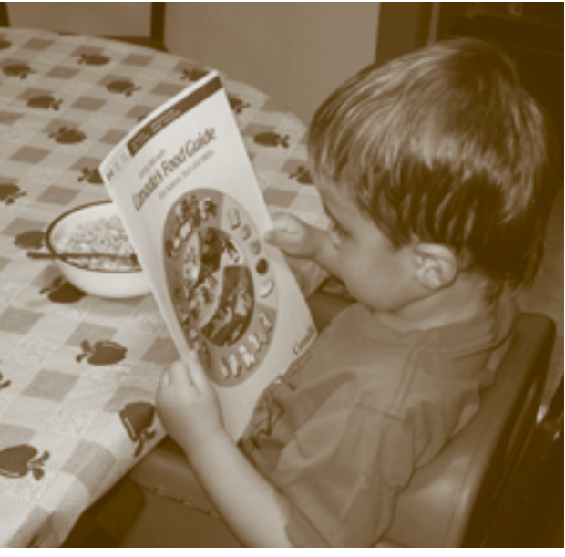
The new Canada's Food Guide – First Nations, Inuit and Metis makes interesting breakfast table reading.