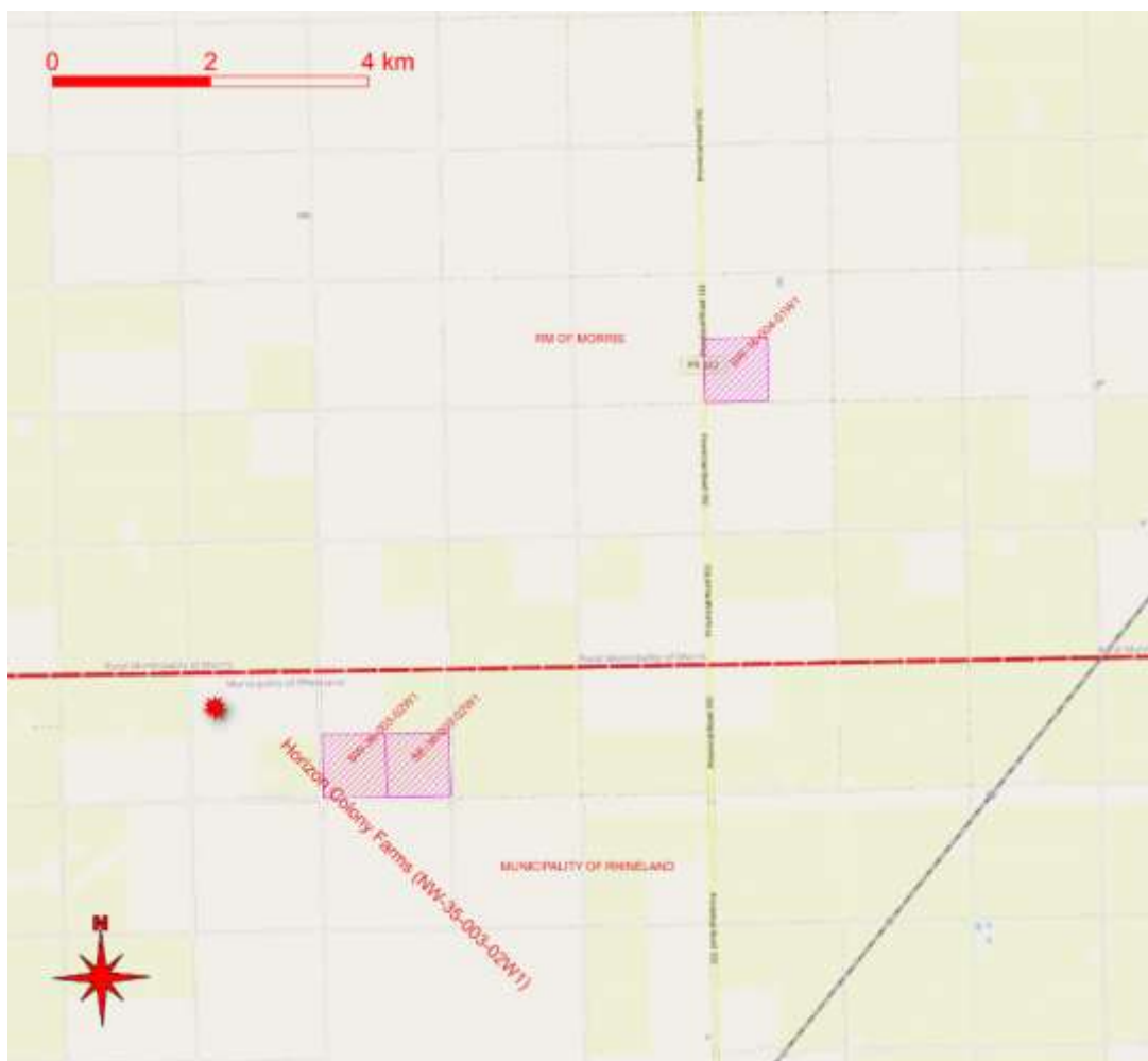
FIGURE 1: LOCATION OF HOG OPERATIONS (HORIZON COLONY FARMS)

Horizon Colony Farms Ltd. was incorporated on March 17, 2008. It established livestock operations within three existing hog production facilities (Figure 1) comprising a farrowing operation, and two finisher operations (Table 1) with a production capacity at the time of acquisition of 960 animal units. Since then, it has established a turkey production operation with 270 animal units. Horizon Colony Farms is seeking to expand its turkey production facilities to accommodate a maximum of 90,000 birds (900 animal units). Allowing for an additional 10 percent over the next 10 years, it is therefore applying for the conditional use of 99,000 birds (990 animal units) It is also seeking to add broiler chicken production facilities for a maximum of 60,000 birds (300 animal units) in the future too. Allowing for an additional 10 percent over the next 10 years, it is therefore applying for conditional use on the basis of 66,000 birds (330 animal units). Horizon Colony Farms is in the process of constructing new barns for producing both turkeys and broiler chickens and has applied for conditional use of these barns to the RPGA Planning District (Appendix B.4).