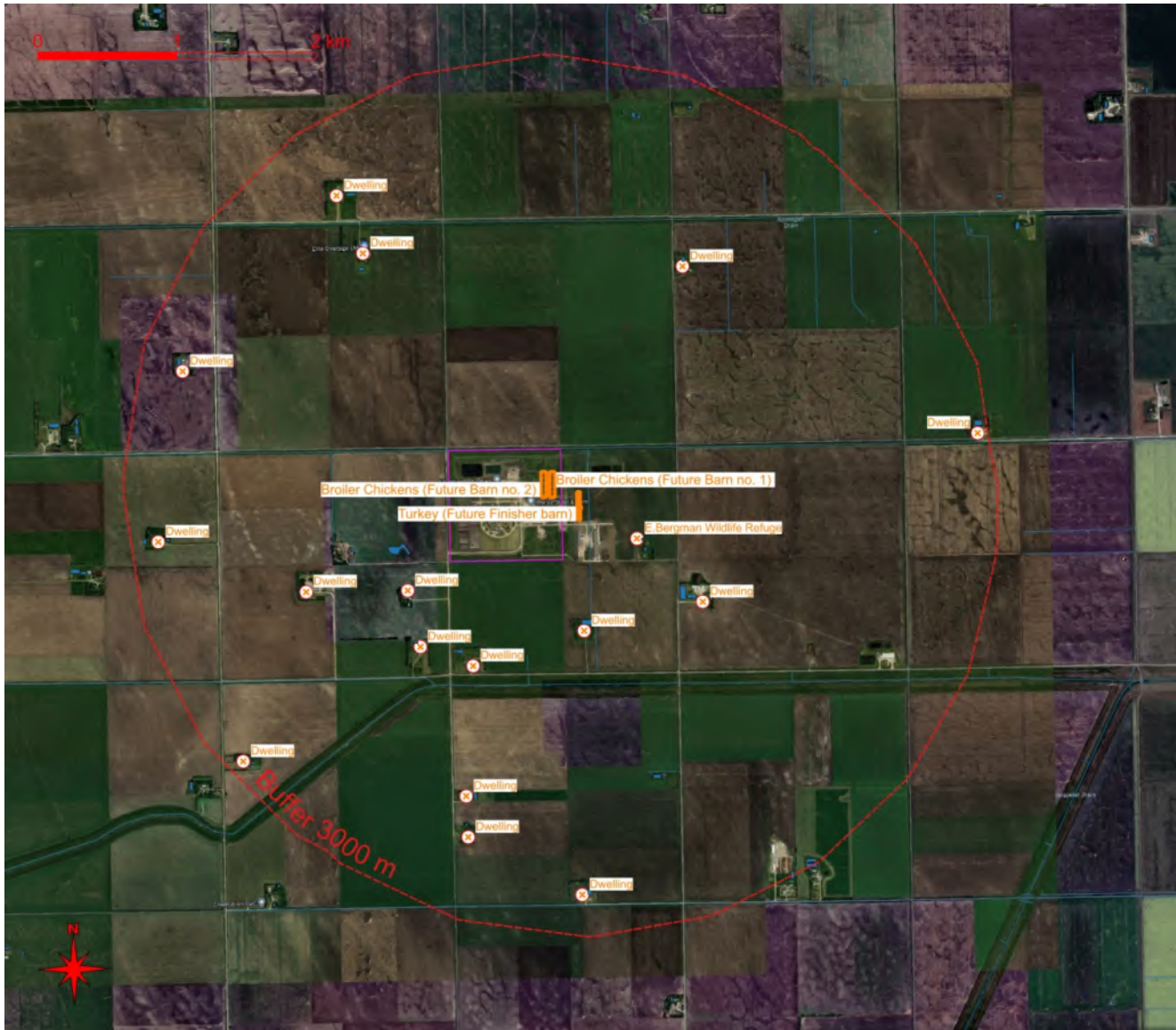
FIGURE 6: DWELLINGS WITHIN 3000 M.