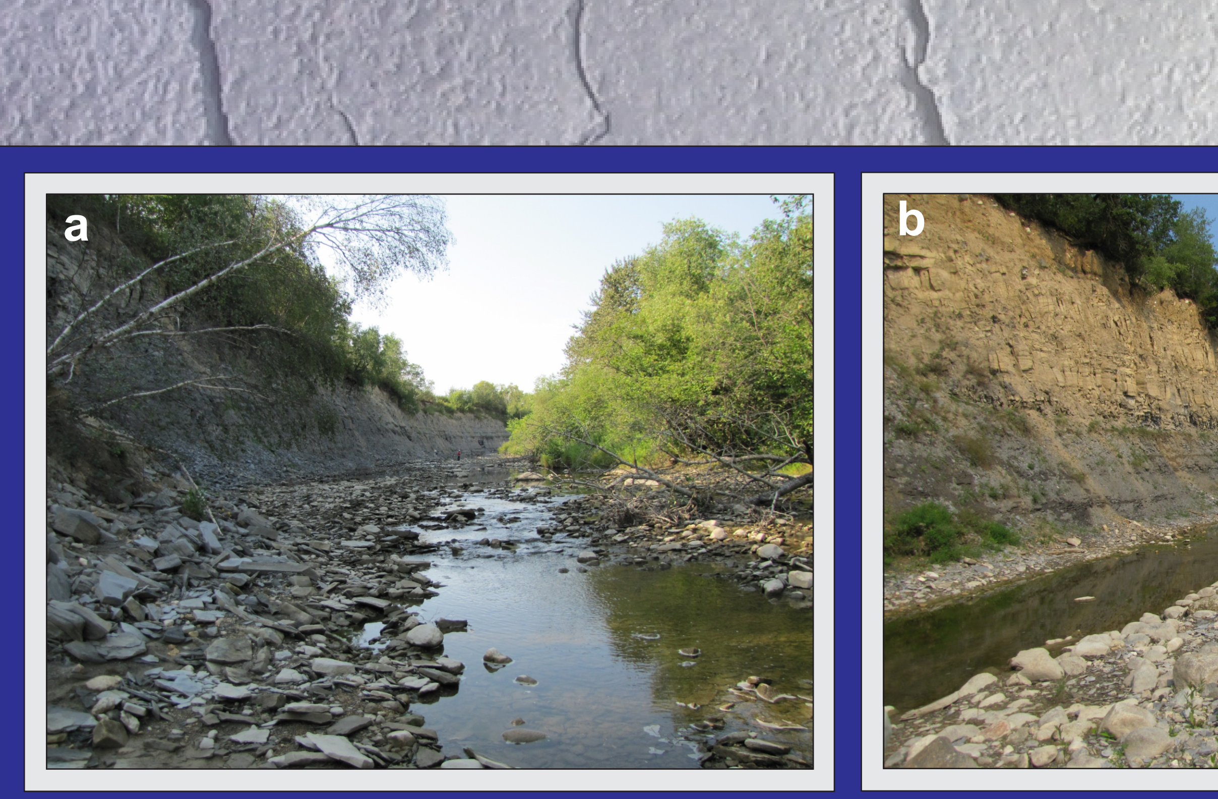
Figure 3: Banks of the Wilson River showing (a) rubble along the shore, (b) vertical cliffs going for long distances, and (c) vertical jointing on the cliff faces.

Figure 1: Fossil of a new specimen of Cimolichythys (Aulopiform, lizardfishes), nicknamed "Wilson", found along the Wilson River, in the Keld Member of the Favel Formation, southwestern Manitoba.