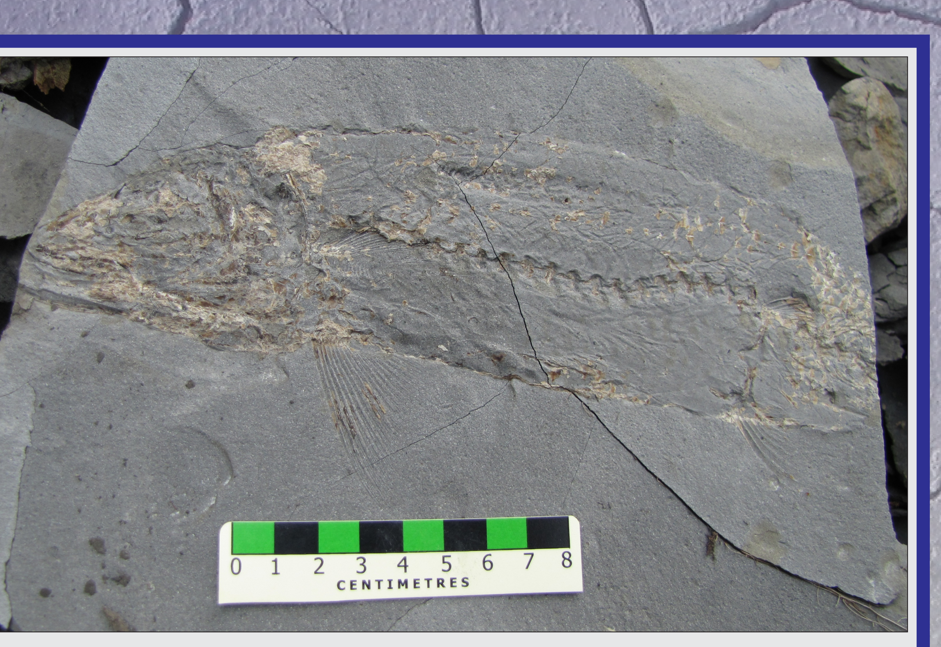
Figure 1: Fossil of a new specimen of Cimolichythys (Aulopiform, lizardfishes), nicknamed "Wilson", found along the Wilson River, in the Keld Member of the Favel Formation, southwestern Manitoba.

<sup>1</sup> Manitoba Geological Survey, Winnipeg, Manitoba, Canada <sup>2</sup> Canadian Fossil Discovery Center, Morden, Manitoba, Canada <sup>3</sup> Department of Biology, Columbus State University, Columbus, Georgia, U.S.A.