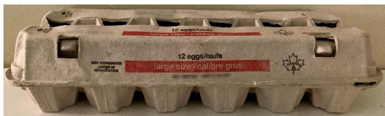
Figure 2a. Photo of front of graded egg carton.