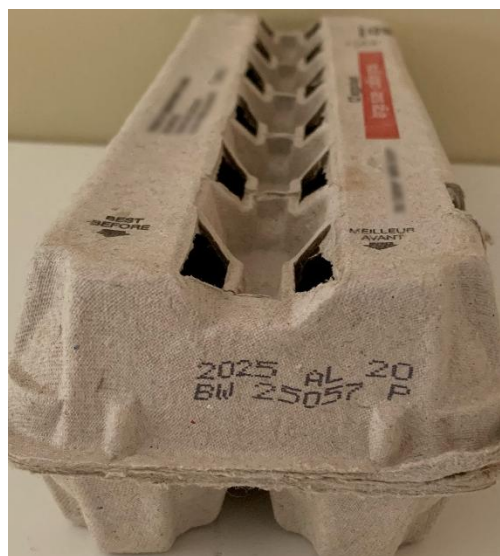
Figure 4a. Photo of side of graded egg carton.