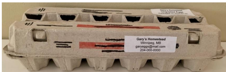
Figure 2b. Photo of front of reused egg carton with size and grade removed. A label with the ungraded egg business name and contact information is added.