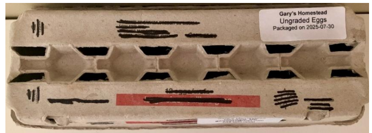
Figure 1b. Photo of top of reused egg carton with business name, grade and size removed. A label clearly labelling the carton as “ungraded eggs” with the business name and package date added.