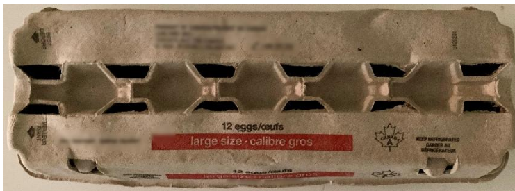
Figure 1a. Photo of top of graded egg carton.