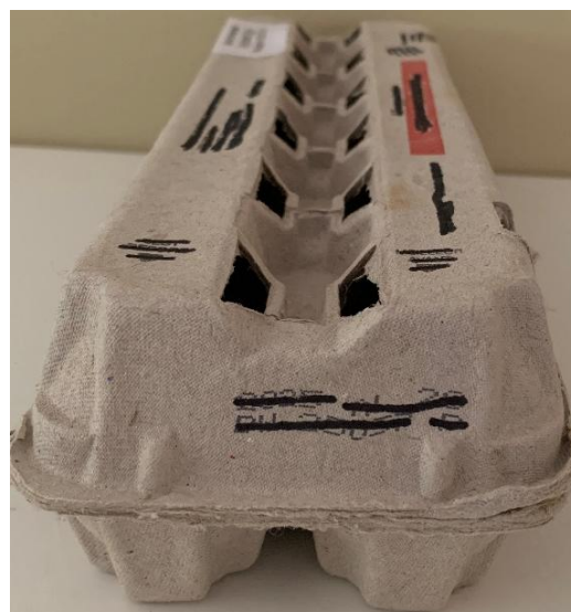
Figure 4b. Photo of side of reused egg carton with best before date and lot code removed.