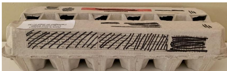
Figure 3b. Photo of back of reused egg carton with nutritional facts and barcode removed.