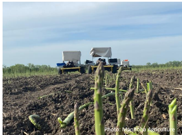
Figure 5. Asparagus Spears May 29, 2026