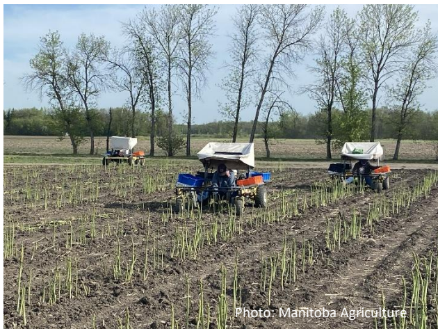
Figure 4. Asparagus Harvesting May 29, 2026

Asparagus producers reported that the start date of their first harvest in 2026 began slightly later than average. One asparagus producer reported wind damage to the spears in early to mid-May. A few asparagus producers reported there was localized frost damage in mid to late May that slowed up harvesting. With the elevated temperatures experienced in late May, several producers have reported that they have had to put in more hours to keep up with harvesting and one producer reported they added additional workers to keep up with the number of harvestable spears.