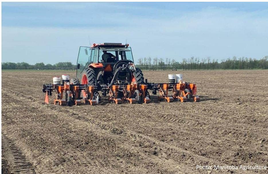
Figure 1. Carrot Planting May 29, 2026

Vegetable transplanting and seeding continues. Most vegetable producers surveyed reported that seeding and transplanting was delayed by three to nine days versus their original planned starting dates. Most vegetable producers also reported that as of the end of May, their seeding and transplanting is either on schedule or is one to two days behind schedule. As of the end of May, vegetable producers surveyed have reported that they have completed between 70% and 90% of their planting. Vegetable producers surveyed reported that transplanting of large-scale fields of warm season crops, such as peppers and tomatoes, began in earnest the last week of May and is progressing well.