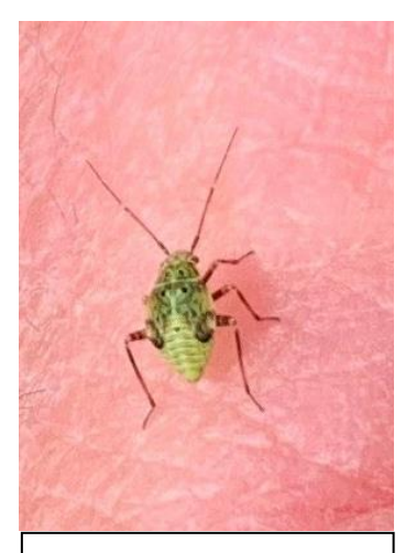
Figure 4: Fifth instar tarnish plant bug nymph stage.