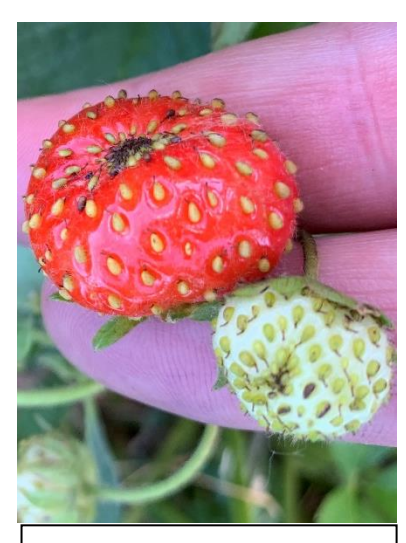
Figure 5: Seedy-end strawberry.