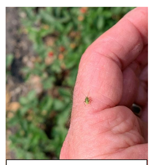
Figure 3: Fifth instar tarnish plant bug nymph stage.

A University of Massachusetts extension factsheet suggests the following cultural control strategies as well: a) avoid mowing nearby fields during bloom or early green fruit stage; b) control weeds in and around the strawberry field which can act as alternative hosts; and c) avoid planting strawberries near alfalfa which attracts TPB.