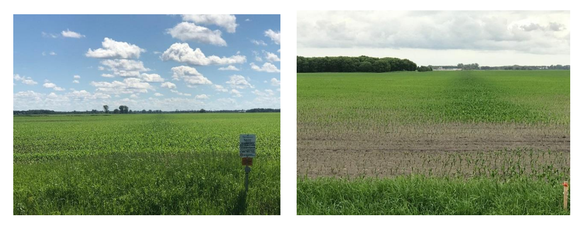
Figures 15 and 16. Advanced corn growth over pipeline right-of-ways.

We're noticing more advanced corn growing over top of the pipelines this spring (Figures 15-16). The probable cause is warmer soil temperatures. Local farmers observe that snowfalls melt quicker over the pipelines. Usually pipeline right-of-way rehabilitation includes applying lots of fertilizer in these strips. But in this case I think we are just seeing the contrast of soil temperatures in a spring where soils have been slow to warm up, and a crop like corn that desires warm soil (>10C) for root growth.