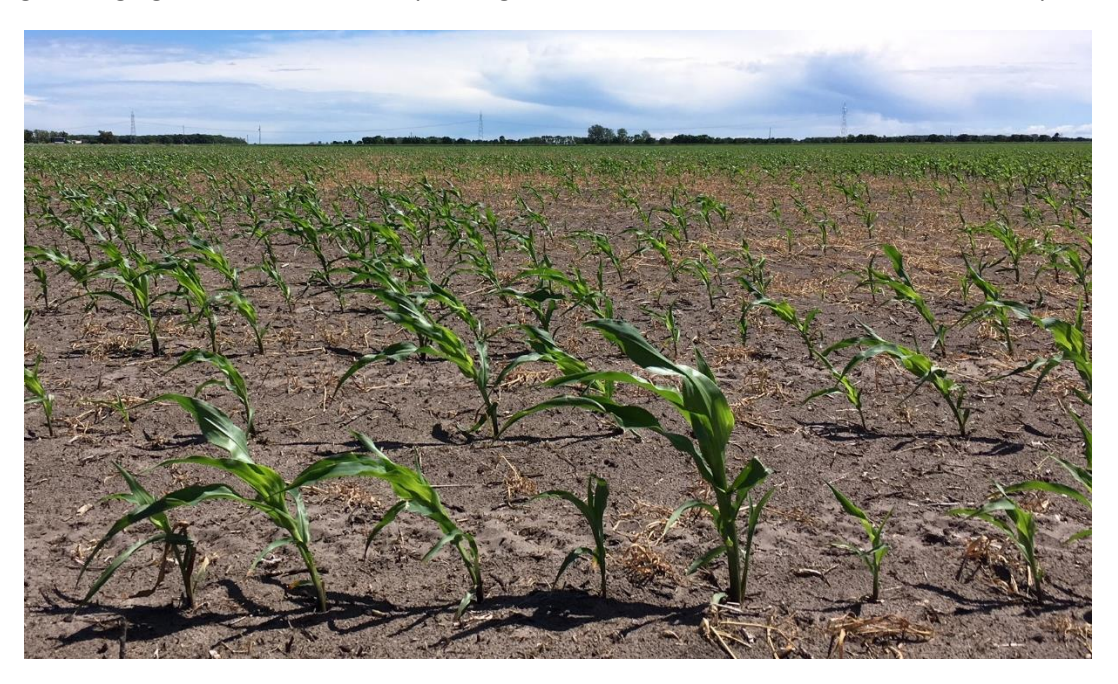
Figure 1. Uneven emergence in dry soil.

The most common reason for uneven emergence is dry soil. Dry soil conditions seen throughout Manitoba this spring and continue in some areas. Dry soil during or shortly after planting can result in seedlings emerging at different times depending on the moisture conditions where the seed placed