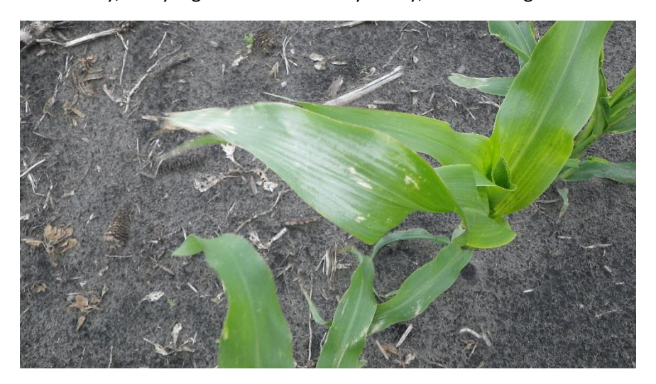
Figure 12. Sunscald of corn leaves.

Sunscald shows up as gray or discolorations of the leaf. These are usually irregular light gray or silvery blotches on the underside of leaves, more often on the east side of plants (Figure 12). It usually occurs when chilly, dewy nights are followed by sunny, hot mornings.