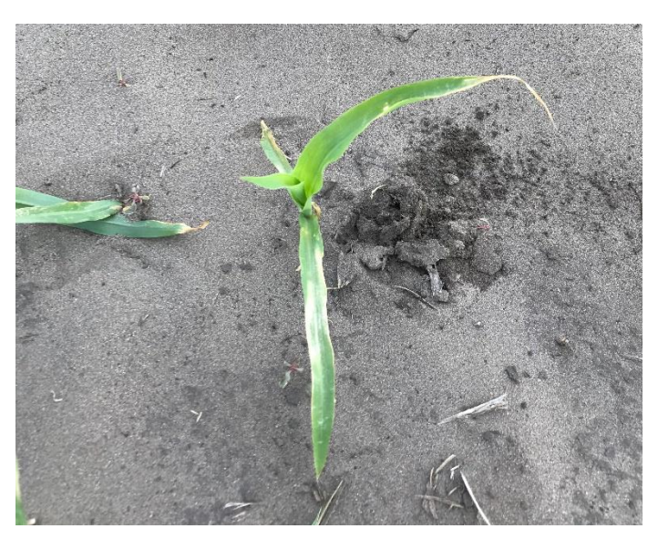
Figure 11. Physical injury to corn leaves due to sand blasting and wind.

The high winds have caused sand blasting injury on some corn on sandy textured soils (Figure 11). Such injury could be minimized by using reduced tillage. Many farmers seeding onto high-risk soil now seed a cereal cover crop prior to corn planting to provide early season shelter.