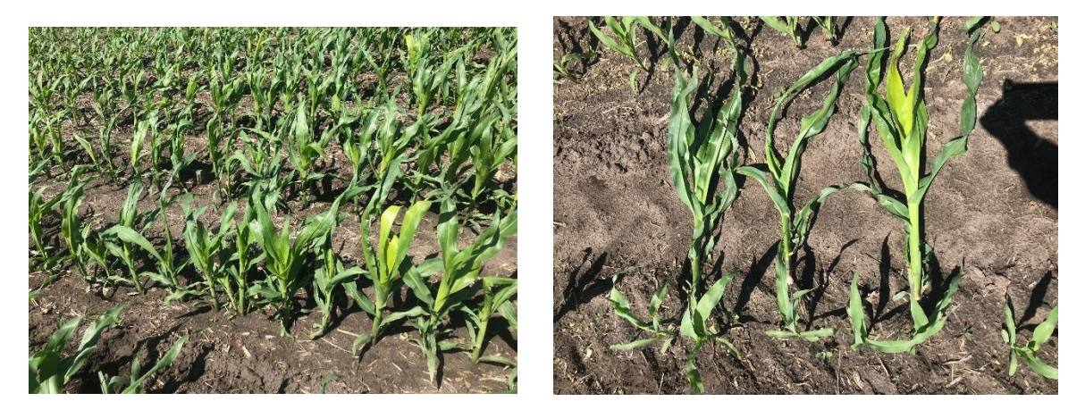
Figure 13-14. Rapid corn growth resulting in twisted leaves in the whorl and yellow leaves.

This is called the "rapid growth syndrome" (Figure 13-14) and occurs with a sharp transition from cool temperatures to warm conditions and an acceleration of growth rate. Some corn leaves fail to unfurl properly and the whorl becomes tightly wrapped and twisted. When these entrapped leaves do emerge they are often bright yellow. These leaves will quickly green up once exposed to sunlight.