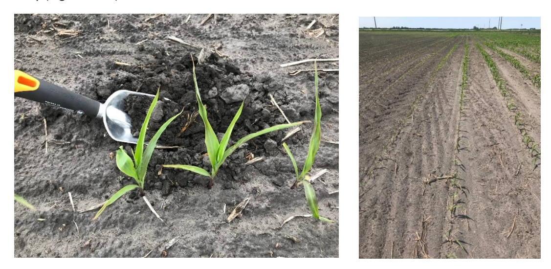
Figure 9-10. Salinity symptoms in corn and a typical field patterns

If corn is stunted and wilting even when there appears to be adequate soil moisture, soils may be too salty (Figure 9-10).