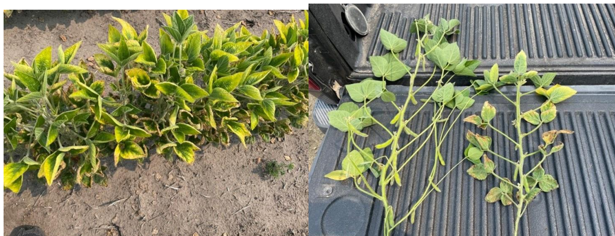
Figure 1 and 2. Potassium deficiency symptoms in soybeans on sandy soil

There are continued reports of potassium (K) deficiency coming in. The latest is on soybeans in some very sandy soil east of the Red River. Plants are showing the characteristic chlorosis of the leaf margins. With the plant at later reproductive stages, soybeans would normally now be moving some K from the leaves to pod-fill. That may be why a margin deficiency earlier is showing up so vividly now. The solution – soil testing and potash applications as required.