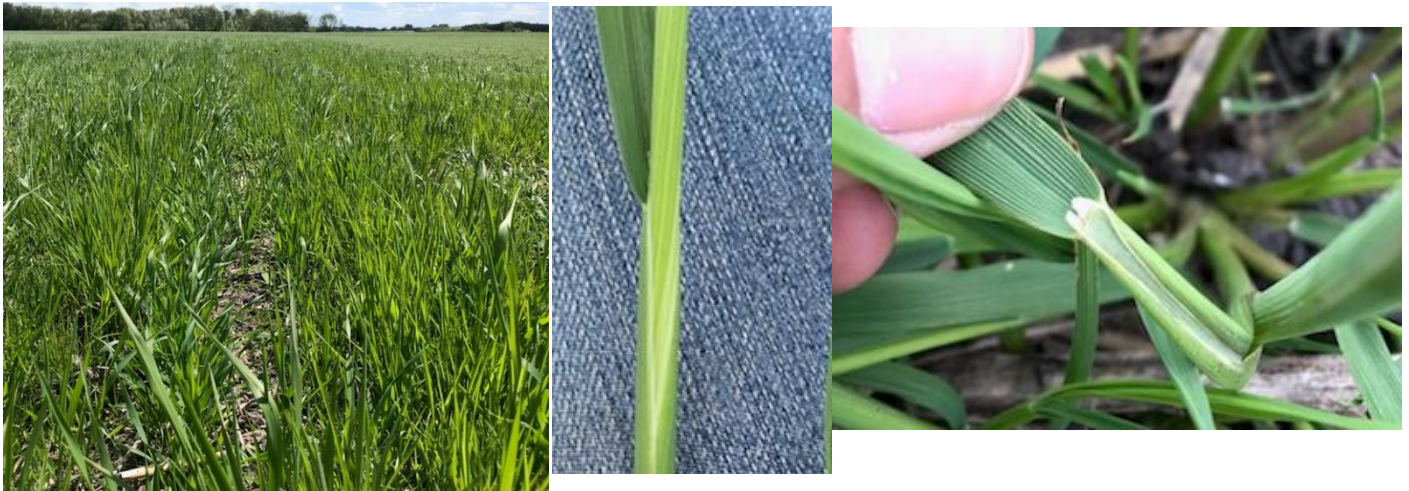
no auricle, membranous ligule and fibrous root system were not enough to figure out this grass weed ID.