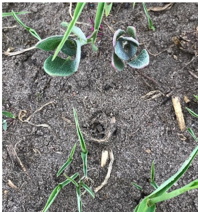
Stressed plants will change their architecture to reduce exposure to the sun.

Avoid the heat of the day – stressed plants reduce overheating and excessive water loss by curling/rolling leaves (like the green foxtail in the picture), folding them up (like the lamb’s quarters in the picture) or by wilting (angling their leaves to hang vertically) - which reduces the surface area exposed to the hot sun and reduces herbicide interception.