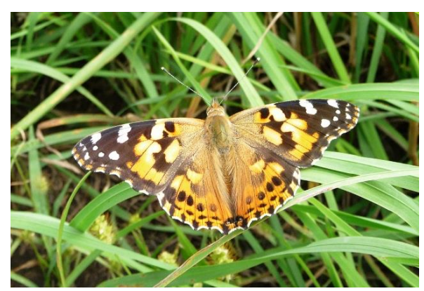
Adult (painted lady butterfly)

Wheat Midge : Based on degree day forecasts, approximately 5% of the wheat midge population was in the adult stage as of July 8th. It looks like wheat midge emergence should begin to occur over the next week.