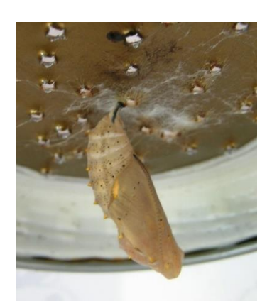
Pupa of thistle caterpillar.