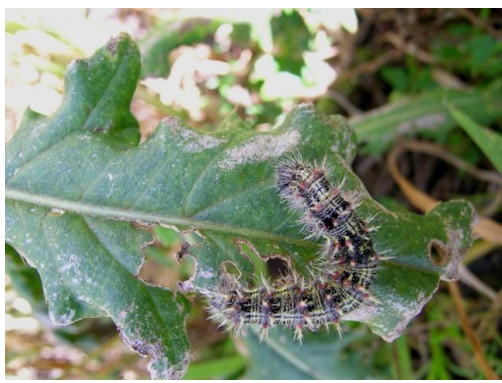
Larva of thistle caterpillar.