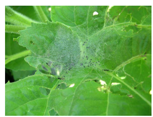
Webbing and frass from thistle caterpillar.