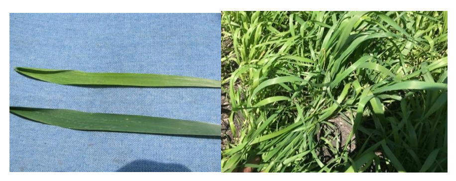
Figure 7 (left). Manganese deficient wheat leaves (top) versus fertilized (below)

At this stage foliar applications may still be effective to salvage yield. On peat soils with known deficiencies, soil applications are expensive but often necessary to optimize yield. Repeated copper treatments at tillering and flag leaf stage may be needed when using foliar applications.