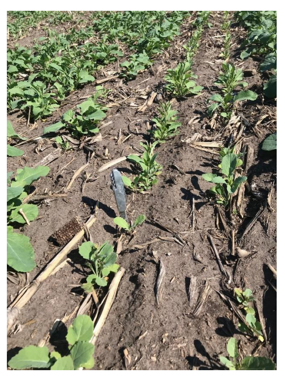
Figures 9-10. Sulphur deficiency in row patterns.