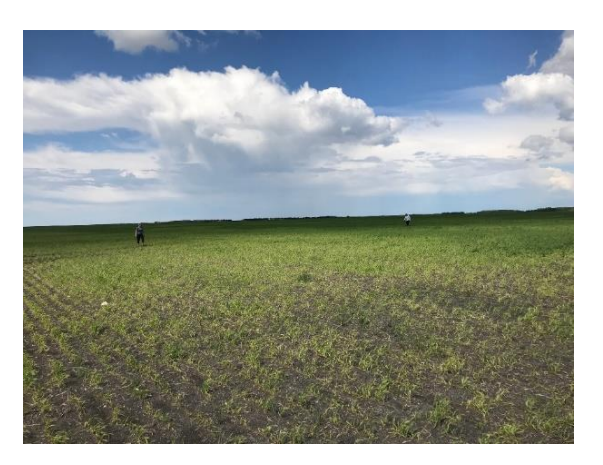
Figure 6. Diagnostic tissue sampling of good versus poor areas.

Individual wheat leaves showed typical symptoms of both Mn and Cu deficiency: