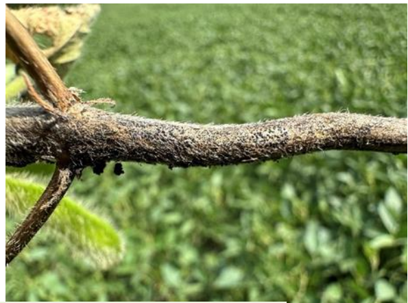
Frog-eye leaf spot (left) and Diaporthe stem canker (right) on soybean.