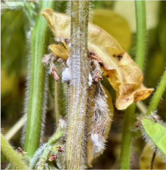
White mold on stem of soybean.

Last week we mentioned Sclerotinia and the many crops that it can infect. Although soybean is less prone to infection, and only rarely suffers yield loss, it is a host. Where moisture is maintained under a dense canopy the fungus can colonize flower parts and work its way into stems and pods.