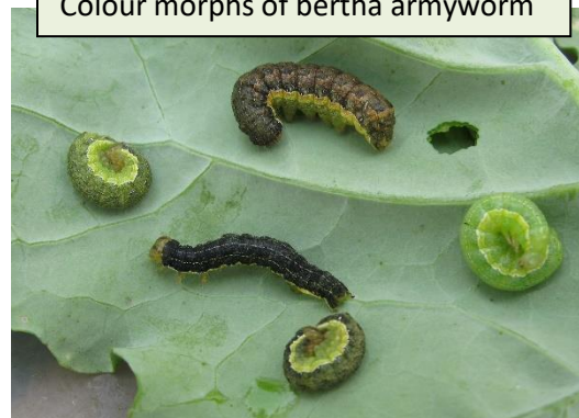
Colour morphs of bertha armyworm