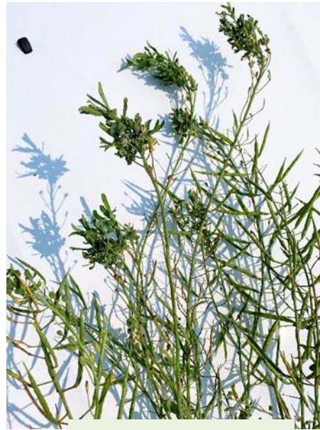
Aster yellows on canola