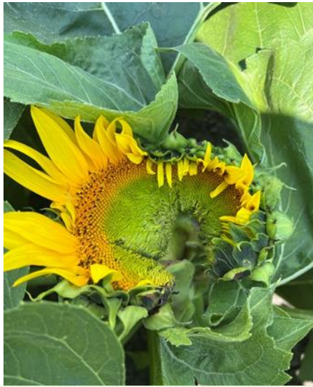
Aster yellows causing phyllody on both ray flowers and disc flowers in sunflower.