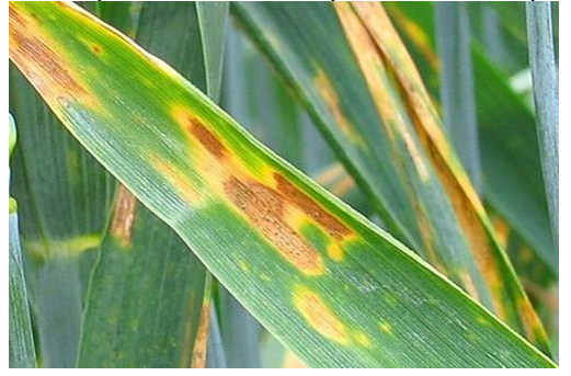
Septoria leaf spot on wheat.

When inoculum is coming from stubble, the next disease to appear in wheat is Septoria. It thrives in warmer conditions than does tan spot. Lesions are lighter coloured in the middle and peppered with tiny black pycnidia. These produce asexual spores that are spread within the crop by rain splash.