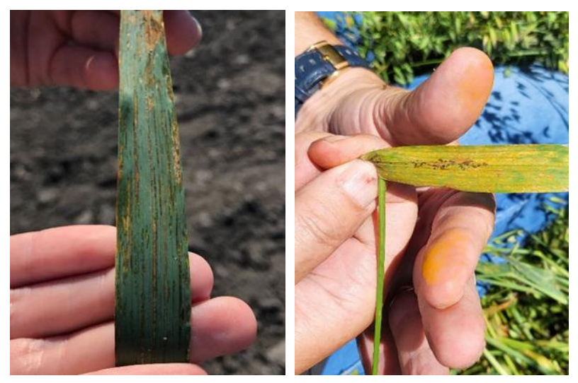
Bacterial blight (L) and oat crown rust (R)

Remember that winter wheat is now, or soon will be in the vulnerable stage for Fusarium head blight infection. Consult the new FHB Risk Mapping tool for the risk in your area – <u>prairiefhb.ca</u>