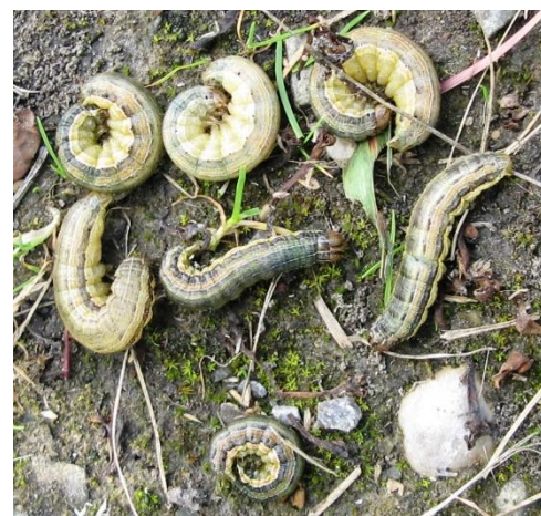
Figure 4. Armyworm larvae

Guidelines for monitoring larvae of armyworm can be found at: https://www.gov.mb.ca/agriculture/crops/insects/pubs/armyworms-factsheet-revised-january2024.pdf