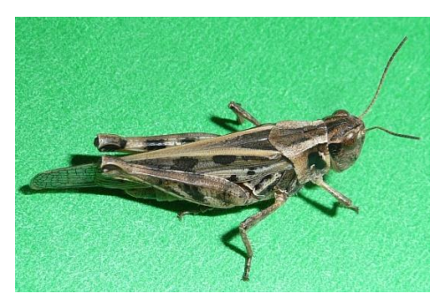
Twostriped (left) and clearwinged (right) grasshoppers

Grasshopper surveys have been conducted in Manitoba in various degrees of detail since 1931. The current grasshopper forecast is based on counts of grasshopper populations in August (which estimates the egg-laying population), weather data (which helps estimate whether those female grasshoppers present are capable of laying their optimum level of eggs), and recent trends in grasshopper populations. In some years, natural enemy populations may significantly affect the number of grasshoppers, or the number of their eggs that survive and hatch, and such data may be pertinent to the forecast as well. Counts are generally done in or alongside crop fields in Manitoba. The goal is to estimate levels of the four species of grasshoppers that have potential to be pests of crops in Manitoba.