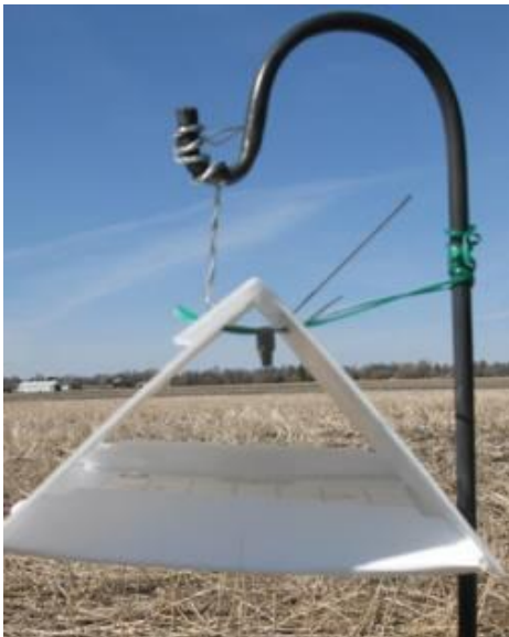
Figure 1. Trap for diamondback moth

Pheromone-baited traps (Fig. 1), which attract the male moths, are established for a 6-8 week period from early-May until late-June to detect the arrival of populations of diamondback moth early in the season. The cumulative counts from the traps, and how early larger numbers of moths arrive, cannot predict what levels of larvae will be, but can be used to determine regions of the province where increased attention for diamondback moth is recommended when scouting fields.