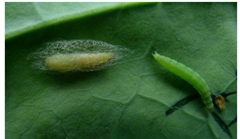
Figure 4. Diamondback moth pupa (left) and larva (right).

Guidelines for monitoring larvae of diamondback moth can be found at: https://www.gov.mb.ca/agriculture/crops/insects/pubs/diamondback-moth-factsheet.pdf