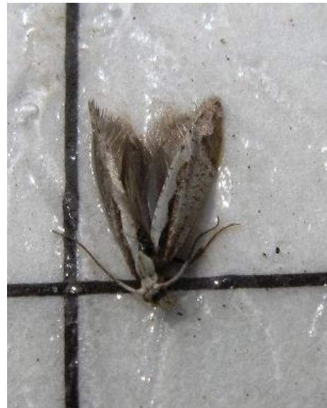
Figure 2. Diamondback moth on insert of trap