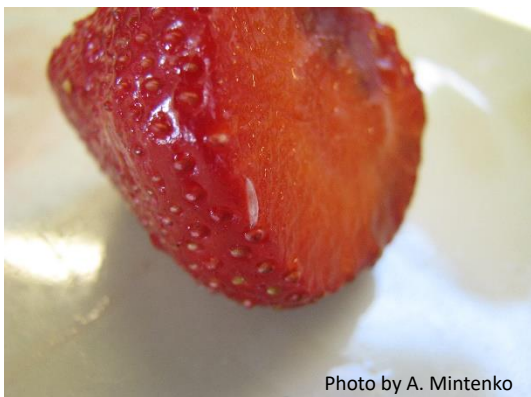
Figure 2: SWD larvae on strawberry.

Commonly confused with the common fruit fly, Drosophila melanogaster , SWD differ as they attack unripe and ripe fruit, whereas the common fruit fly feeds on overripe and rotting fruit. SWD most commonly affect strawberries, raspberries, saskatoons, cherries and plums.